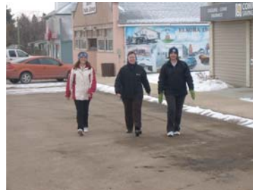
Elnora Walking Group

All of the active living in Elnora can leave residents hungry, including school children. The "Fruit to the School" program helps ensure students are receiving the healthy eating components they need and receive a healthy treat at least once a week. Each Thursday fruit is purchased from the local grocery store, washed, cut and set out for the students just before the noon break. Depending on the season, fruit can include pineapple, cantaloupe, watermelon, grapes, apples, pears, strawberries and blackberries. When students see the healthy treats arrive at the school every Thursday, there are shouts of "It's Fruit Day!"