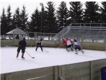
3 on 3 Hockey Action

Active living is not limited to indoor activities in Elnora. The 3 rd Annual 3 on 3 Outdoor Hockey Tournament was recently held with the help of the Eagles Ball Team. This year, 6 teams laced their skates during the February 13 th and 14 th weekend event. The outdoor rink